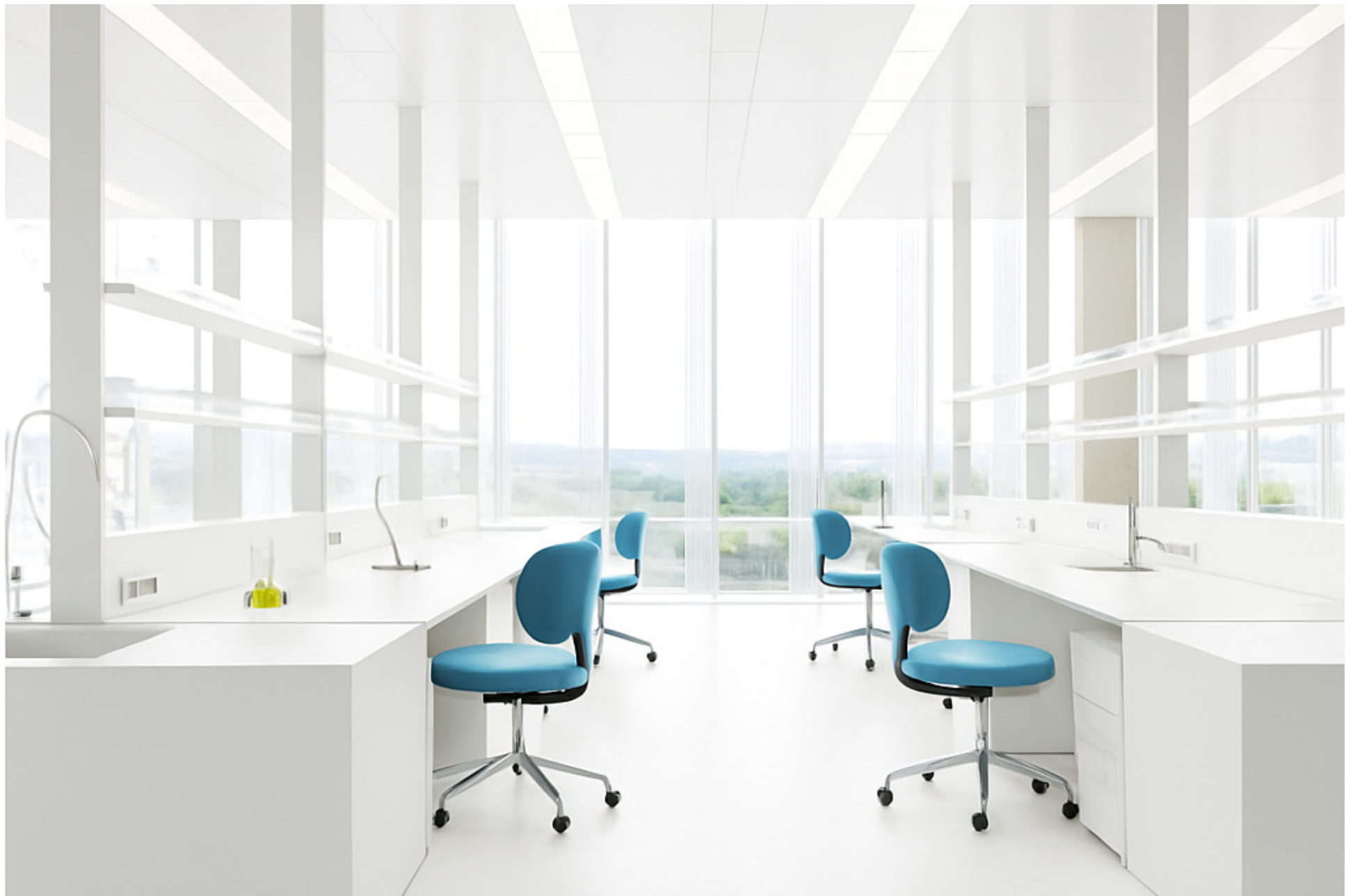
RENDERING INTERNO LABORATORI