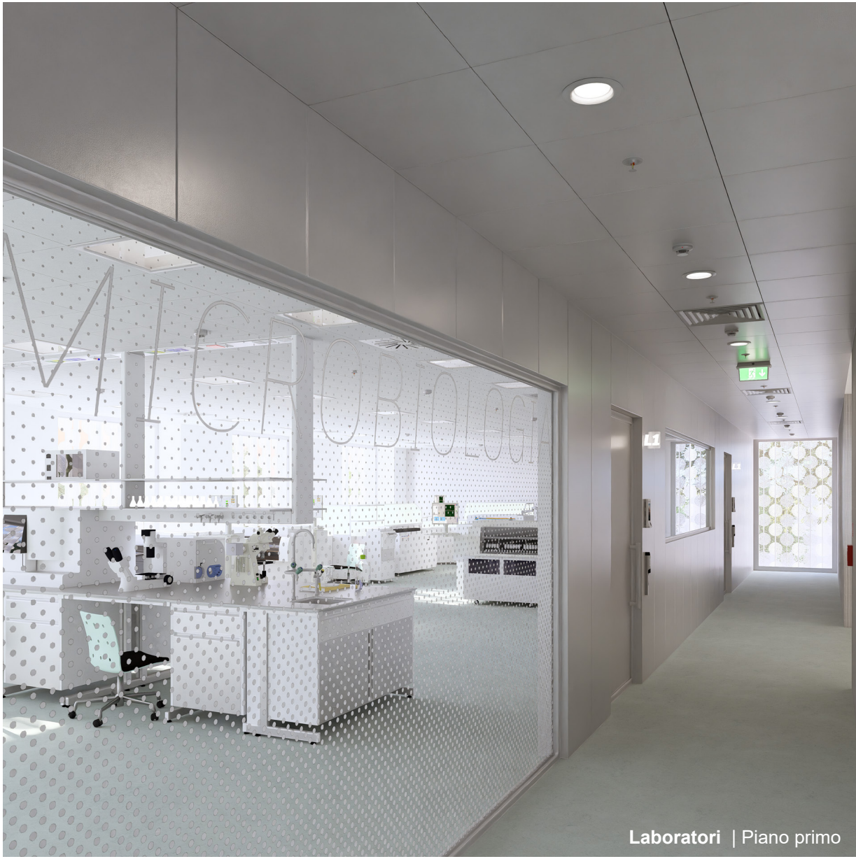
Laboratori | Piano primo