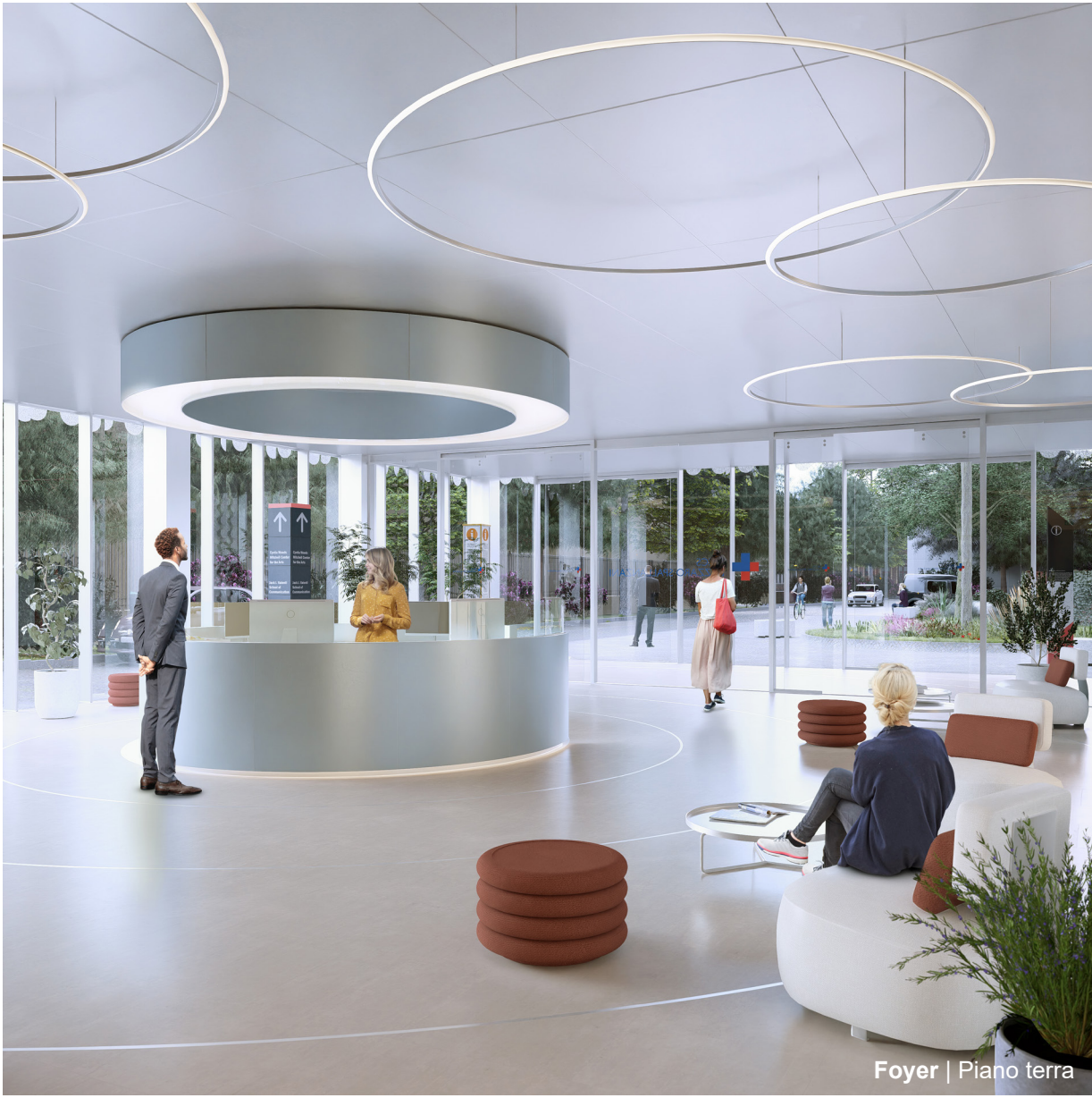
Foyer | Piano terra