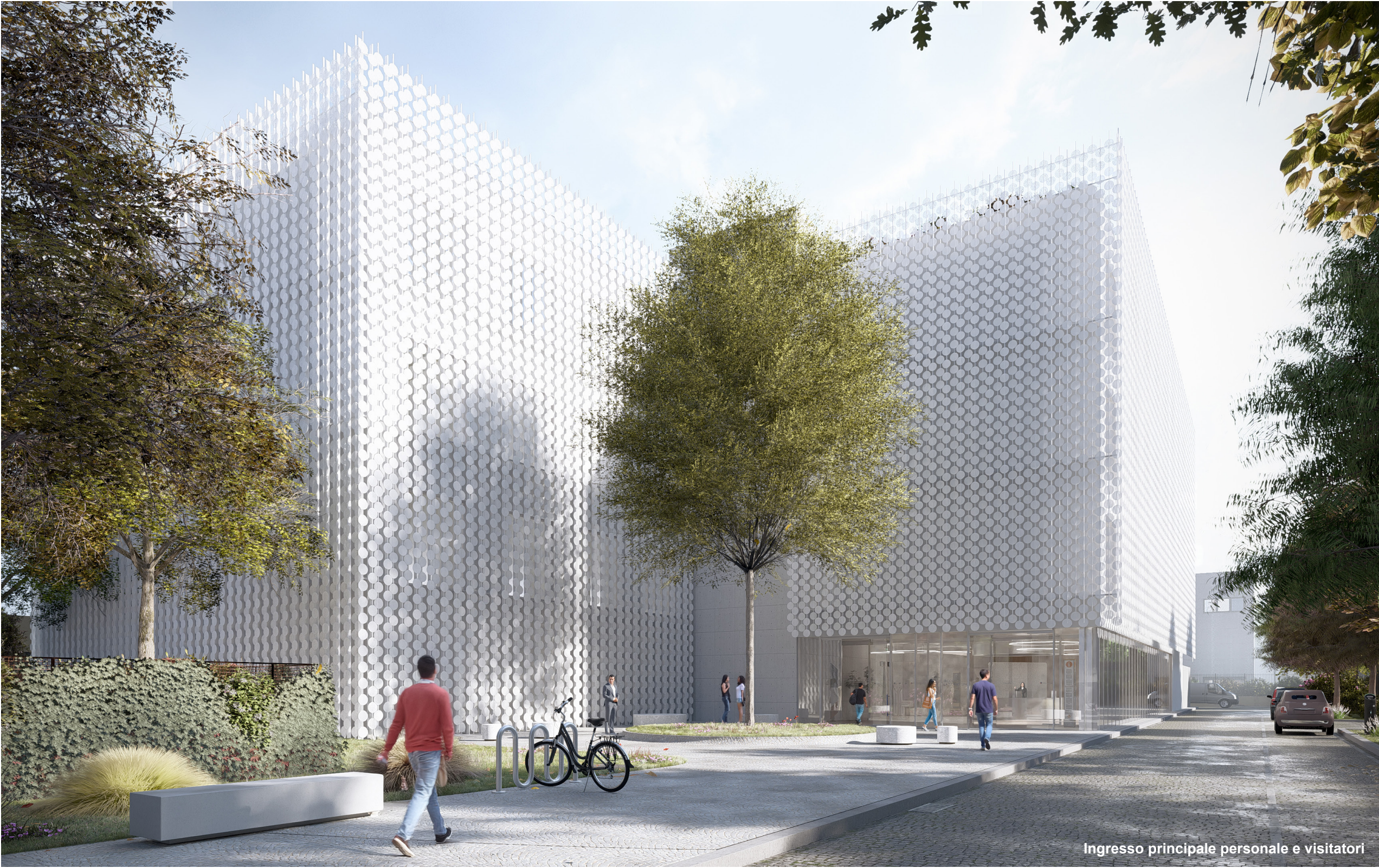
Ingresso principale personale e visitatori