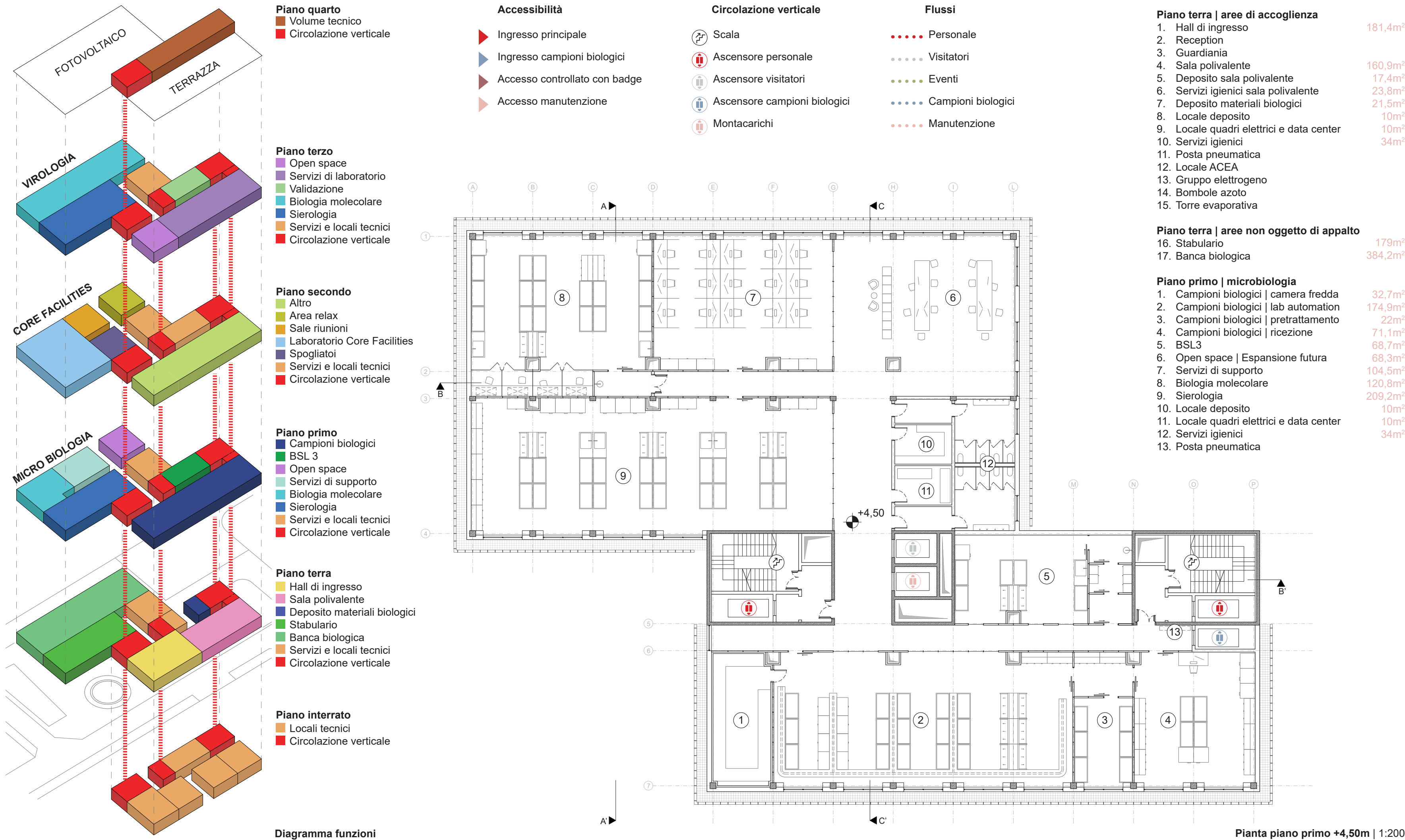
Pianta piano primo +4,50m | 1:200